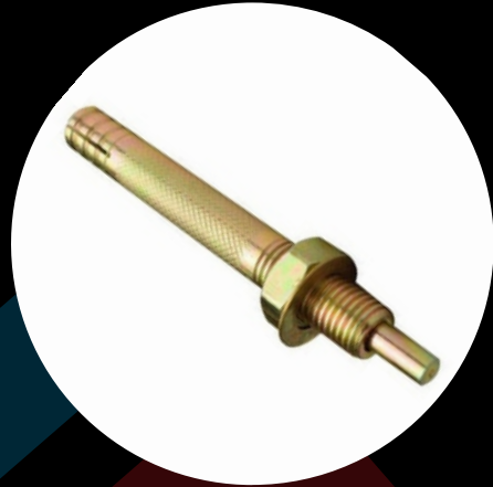
PIN TYPE ANCHOR BOLT