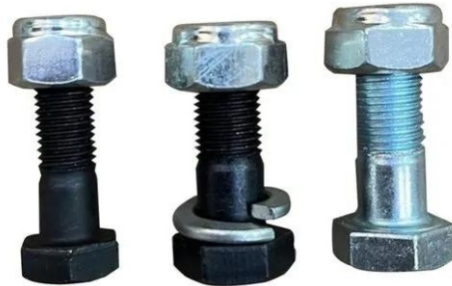
ROTAVATOR BOLT (14X1.5X40)