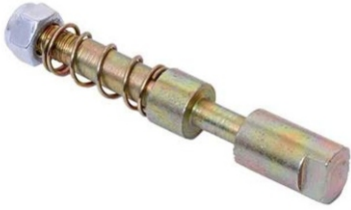
ROTAVATOR PUSH PIN