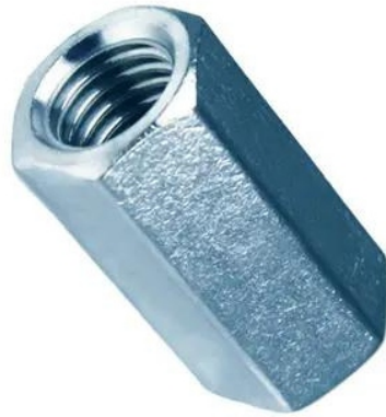
LONG NUT (COUPLING NUT)