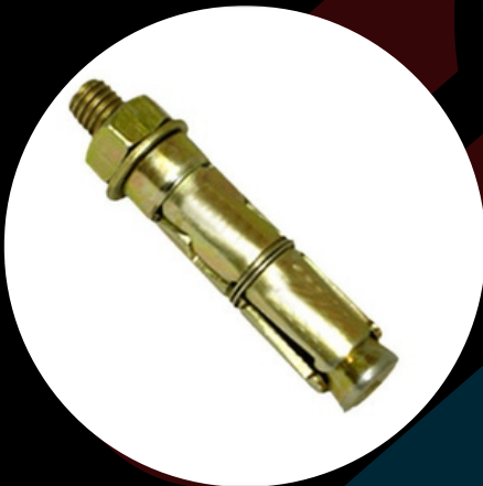
RAWAL ANCHOR BOLT