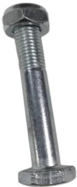
ROTAVATOR JOIN BOLT