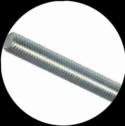
THREADED RODS/ STUDS